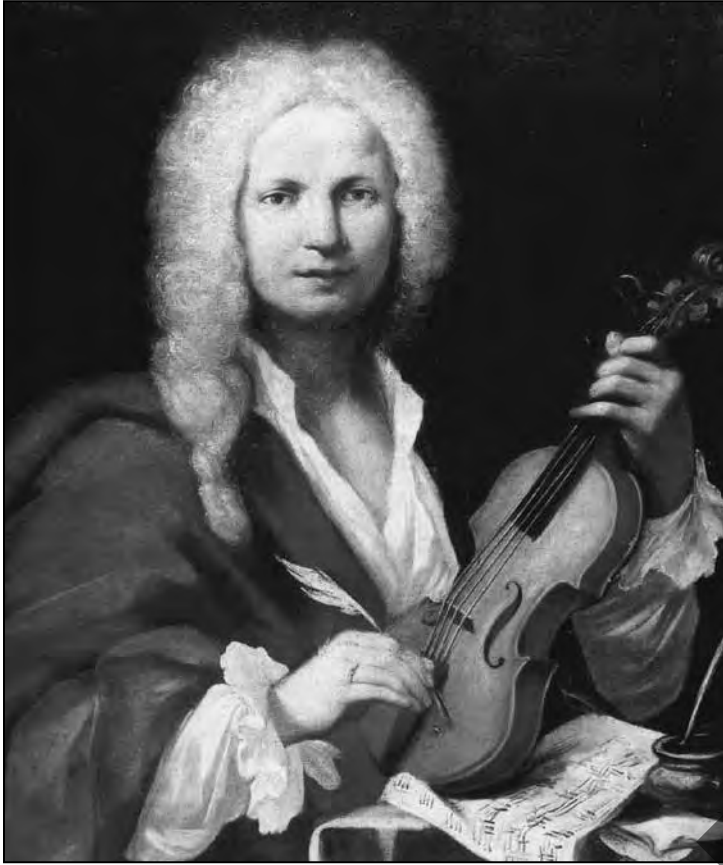
1678-1741 Italian Composer, Violinist & Teacher